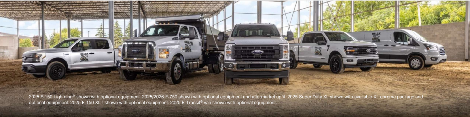
2025 F-150 Lightning ® shown with optional equipment. 2025/2026 F-750 shown with optional equipment and aftermarket upfit. 2025 Super Duty XL shown with available XL chrome package and optional equipment. 2025 F-150 XLT shown with optional equipment. 2025 E-Transit ® van shown with optional equipment.

Now's the time to power your bottom line and your operation with vehicles that are all business. Ford is #1 in commercial vehicles for 40 consecutive years 1 with jobsite-ready trucks that have the highest brand loyalty in the industry 2 and America's best-selling full-size commercial van, 3 Ford Transit ® van, both engineered Built Ford Tough to help you do more and spend less over the life of your fleet. So, don't miss this opportunity to save big on your 2026 Ford commercial fleet by acting today.